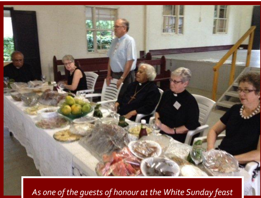
As one of the guests of honour at the White Sunday feast held after the service